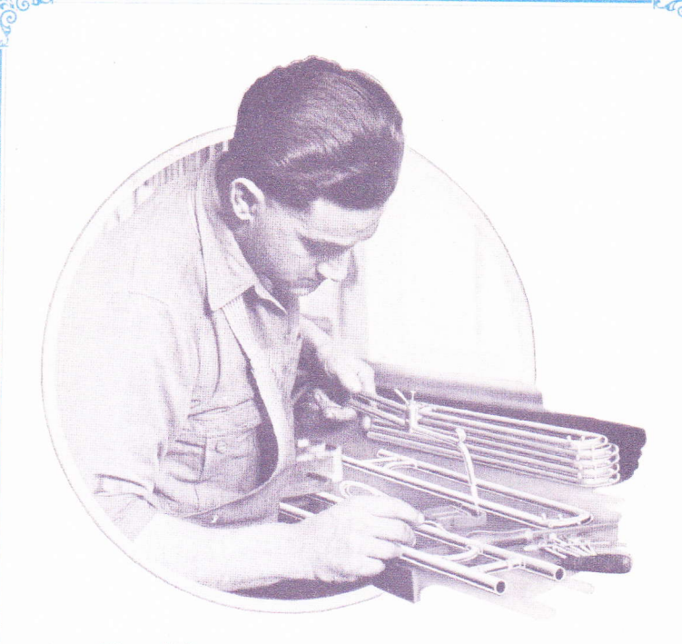
Assembling slides to give perfect slide action even in seventh position.