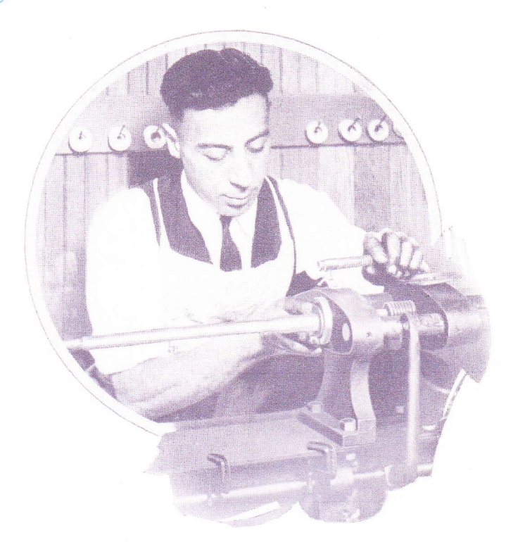
The first step in building an OLDS trombone Drawing the Tubing

HROUGHOUT every step in the manufacture of OLDS trombones infinite care is taken to insure