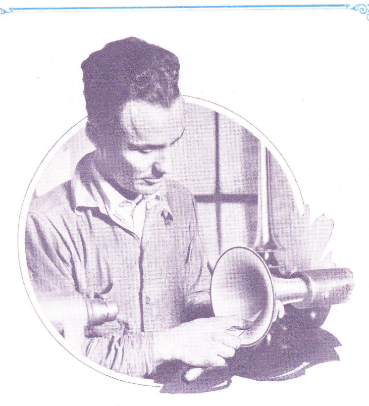
Building the tone into the OLDS trombone

PECIAL tone qualities are built to order into each OLDS trombone, giving an individuality to an artist's playing